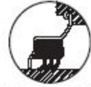
TRL type seal