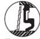
SR type seal