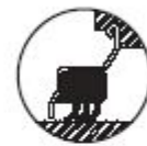
TRL type seal