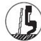
SR type seal